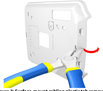
Figure 2: Surface-mount cabling plastic tab removal

4. Mount the backplate to the wall by securing a M3.5 #6 screw in each of the dedicated mounting holes and tamper hole while ensuring that the top is up, as shown in Figure 3. For EN installations, use the designated mounting holes (#3).