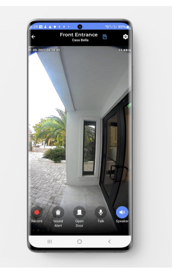
DB7 view cam